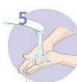
Rinse your hands