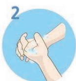
Rub palm to palm with fingers