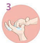
Rub tips of fingers