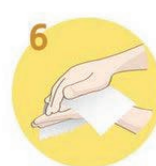
Dry your hands