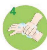
Rub each wrist