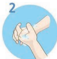
Rub palm to palm with fingers