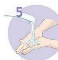
Rinse your hands