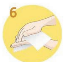
Dry your hands