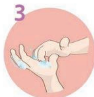
Rub tips of fingers